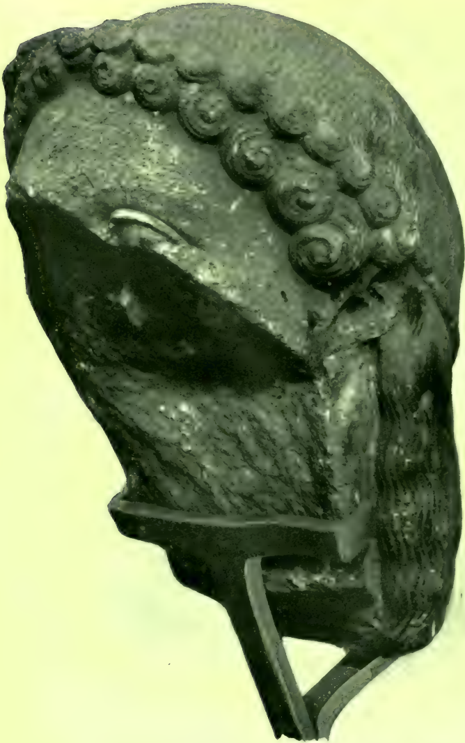
ARCHAIC HEAD FROM TEMPLE OF THE SIRENS