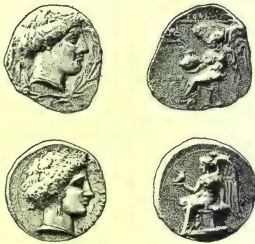
FIG. 3.—Coins of Terina.