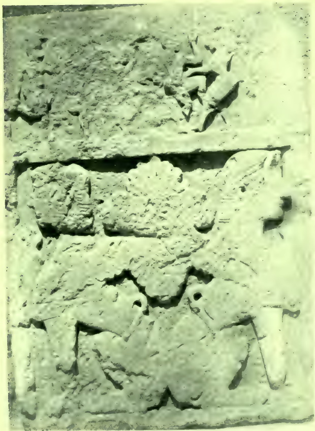
ARCHAIC RELIEF FROM S. MAURO