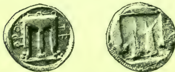
FIG. 2.—Coin of the Alliance between Temesa and Croton.