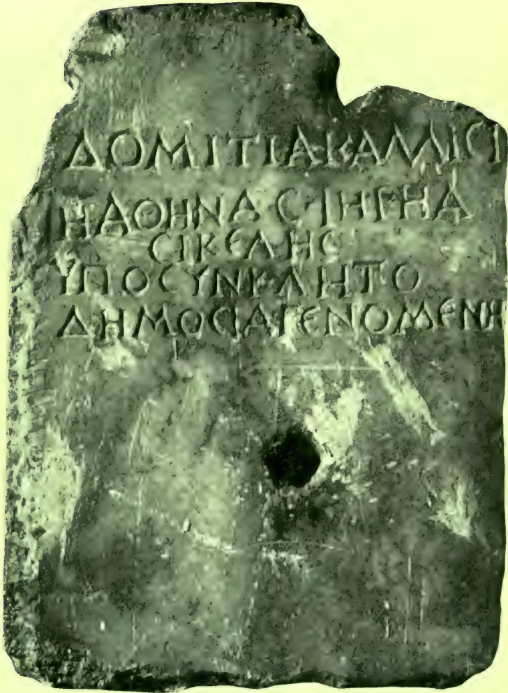
INSCRIPTION REFERRING TO CULT OF ATHENA SICILIANA