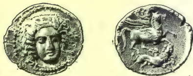
FIG. 10.—Coin of Fenser.