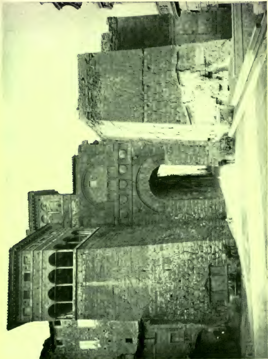
GATE OF THE CITADEL, PERUGIA