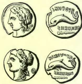
FIG. 1.—Coins of the Auruncians.