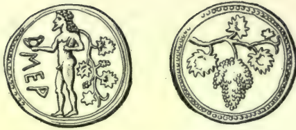
FIG. 6.—Coin of Ergetium.