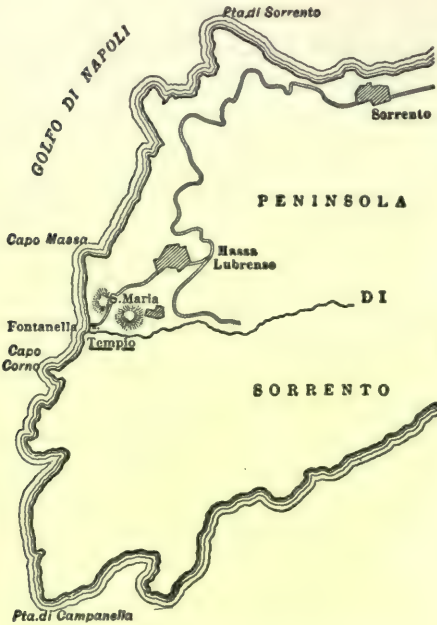
FIG. 11.—Peninsula of Sorrento.

Every student of Neapolitan history knows how many opinions have been advanced concerning the site of this famous temple, from which, according to some, the name of Sorrento itself was