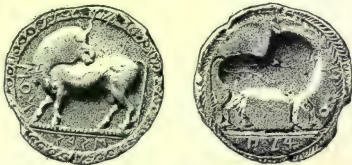
FIG. 5.—Coin of the Alliance between Siris and Pyxus.