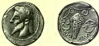
FIG. 8.—Coin of Naxos.