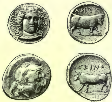
FIG. 9.—Coins of Hyria.