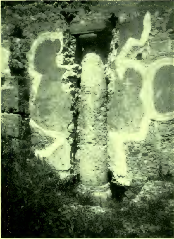
ETRUSCAN COLUMN AT POMPEII