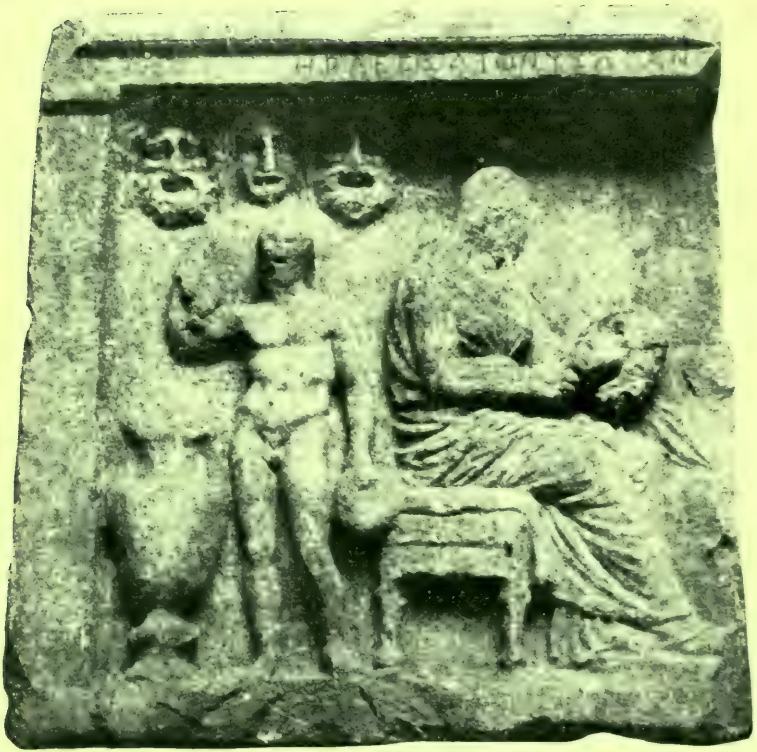
RELIEF AND INSCRIPTION FROM SARDINIA