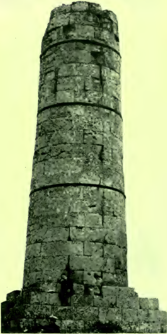
ANCIENT COLUMN NEAR THE ASSINARUS