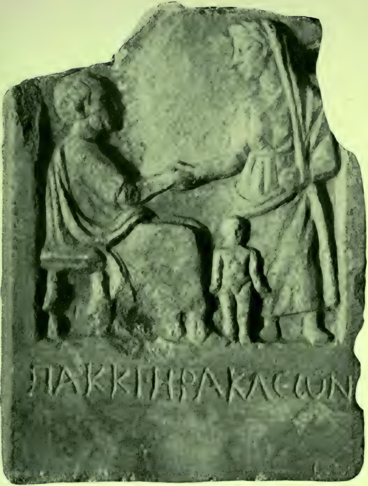
FUNERARY RELIEF (FRONT OF SLAB SHOWN IN PLATE VII)